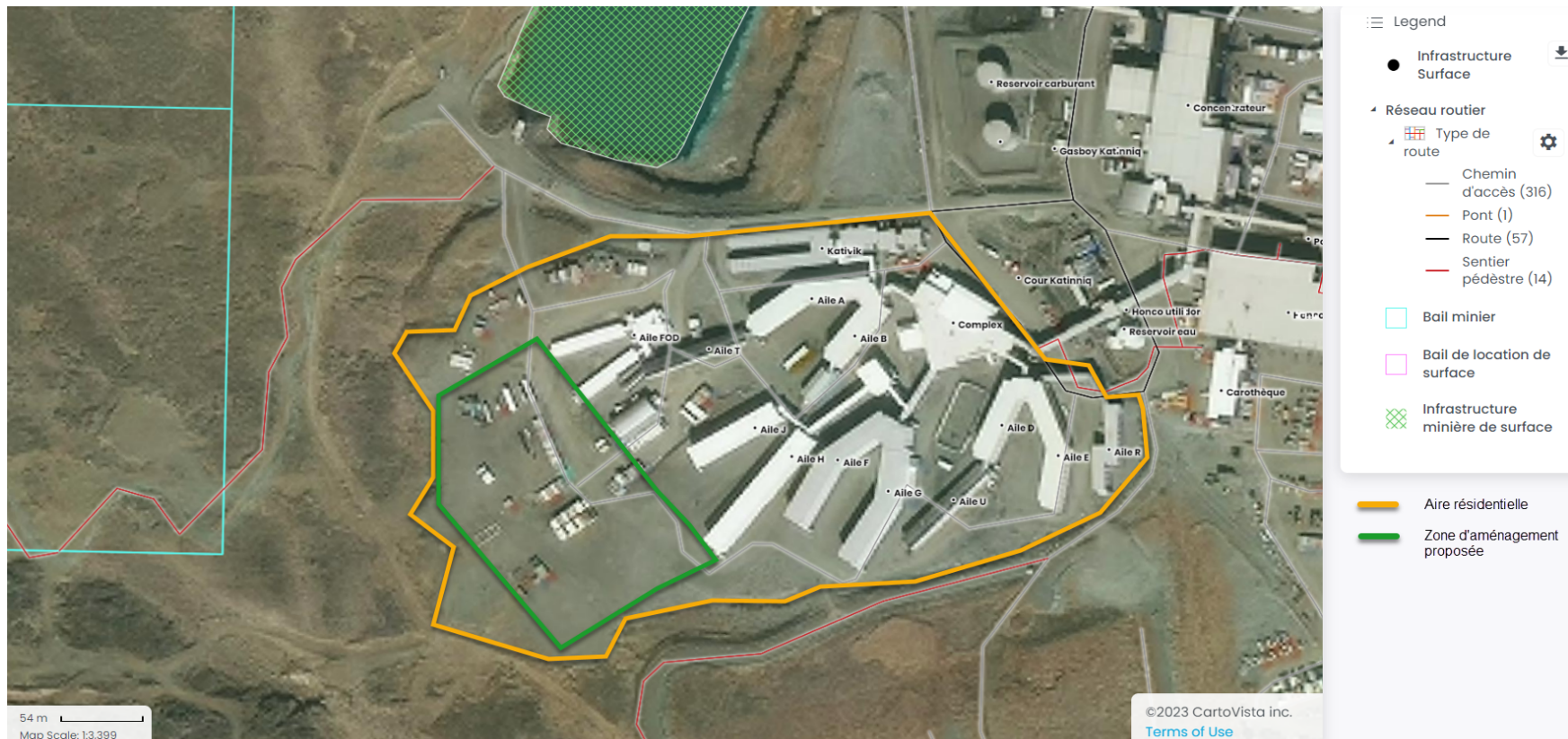
Figure 1 : Proposed area and residential area in Katinniq